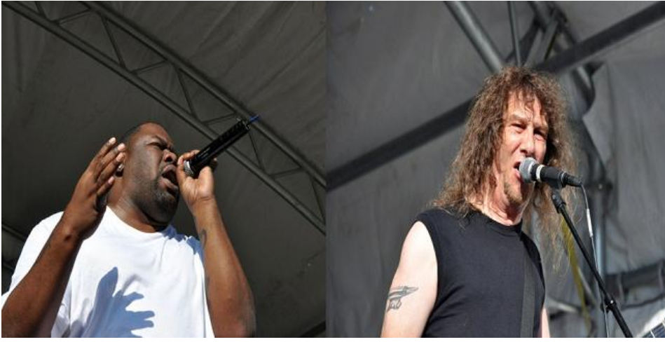
ABOVE L to R: : Biz Markie, Lips (Anvil)